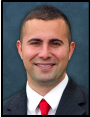
Senator Darren Soto (D) District 14

District Address: Kissimmee City Hall - Suite 305 101 North Church Street Kissimmee, FL 34741 Phone: (407) 846-5187