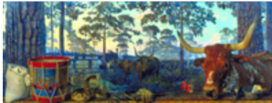
Reflecting on Ocean Pond

▶ Creates a separate account within the Public Education Capital Outlay and Debt Service Trust Fund. The purpose of the account is to ensure sufficient revenue is available to meet both debt service (interest) and bond (principal) payment requirements in a fiscally responsible manner. The first transfers are to occur on or before June 30, 2014.