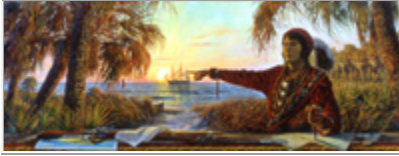
Patriot and Warrior