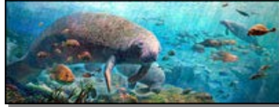
Spring of Life

► Changes the names of Edison State College and Pasco-Hernando Community College to Florida SouthWestern State College and Pasco-Hernando State College, respectively. Edison is changing its name to better represent the five-county region it serves and due to likely legal actions related to trademarks. Pasco-Hernando's name change is to reflect that institution's addition of baccalaureate programs.