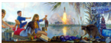
A New Age

▶ Amendments would have removed the requirement for colleges to pay a 5% premium to a Florida based construction contractor for construction services.