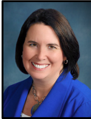
Senator Kelli Stargel (R) District 15

District Address: Suite 102 902 S. Florida Avenue Lakeland, FL 33803 Phone: (863) 284-4430