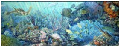
Beyond the Seven Mile Bridge