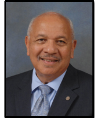
Representative Victor Manuel Torres (D) District 48

Committee Assignments Agriculture & Natural Resources Appropriations Subcommittee Regulatory Affairs Committee State Affairs Committee Transportation & Highway Safety Subcommittee Select Committee on Claim Bills Budget Conference - General Government/Agriculture & Natural Resources