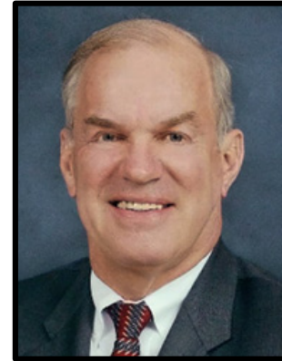
Senator Alan Hays (R) District 11

District Address: 871 South Central Avenue Umatilla, FL 32784-9290 Phone: (352) 742-6441