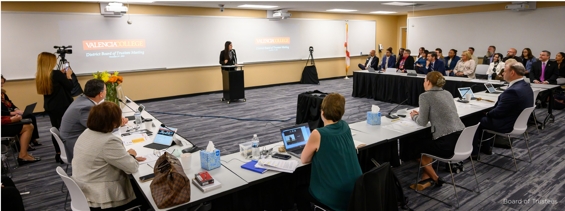
Board of Trustees

Learn more about our governance model at http://valenciacollege.edu/governance/ .