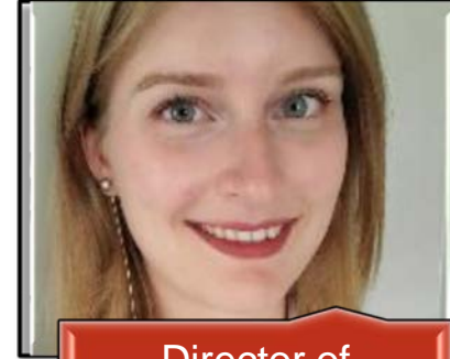
Director of Legislative Affairs