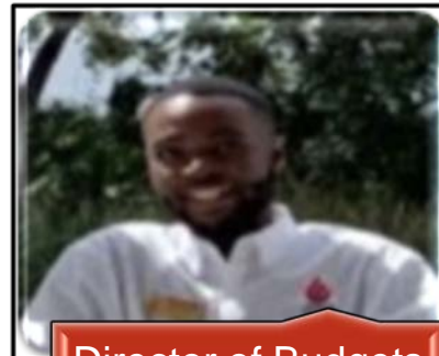
Director of Budgets and Finance