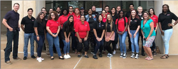
The East Campus CARE team

12,557 Number of unique students Students with confirmed appointments with a Title V touchpoint, or who attended events associated with Title V initiatives through Summer 2020