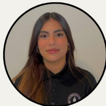
JIMENA FERNANDEZ BRTIO POINCIANA SENATOR