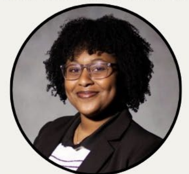
RASHARA GRANT WINTER PARK SENATOR