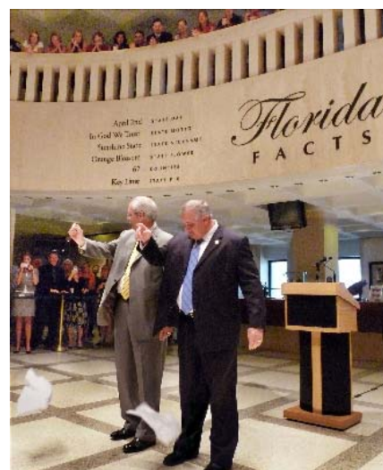
House Sergeant-at-Arms and Senate Sergeant-at-Arms drop the traditional hankies at "sine die" ending the 2009 Legislature.

▶ The District Board of Trustees received authorization to increase college credit program student fees by 8% and workforce program student fees by 8%.