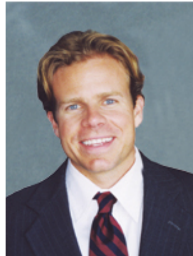
Senator Mike Haridopolos