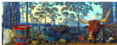
Reflecting on Ocean Pond