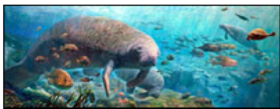
Spring of Life